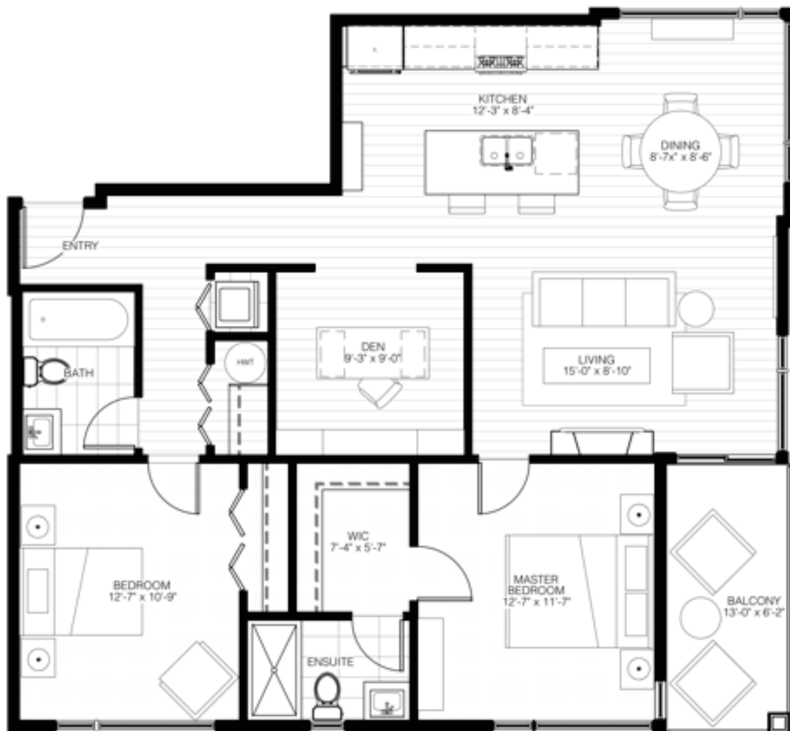
Unit 301 - 1,100 sq. ft.

Situated on a quiet tree lined street near the Jubilee Hospital, this upscale two bedroom (plus den) condo offers so much. Built in 2015 by the award winning Città Group this open concept condo offers 9 foot ceilings, lots of natural light, hardwood floors, quartz counter tops in kitchen and both bathrooms, fireplace, sunny south east facing balcony, covered parking, and a large separate storage. The generous master bedroom features walk-in closet and a delightful ensuite bathroom with large shower and heated floors. This central location is walking distance to Oak Bay Village and downtown Victoria as well as local favourites like Red Barn Market, Pizzeria Prima Strada, Moka House, Christie's Carriage House Pub, Discovery Coffee and other amenities. Easy access to Stadacona Park with its tennis courts with Oak Bay Rec., Willows Beach, Oak Bay Marina, Camosun College & U Vic are just a short drive or bus ride away. Secure bicycle storage room, BBQ's allowed and 1 dog or 1 cat welcome! Call today for your private viewing. Floor plan, maps, walk score, photos and more at www.MyVictoria.ca